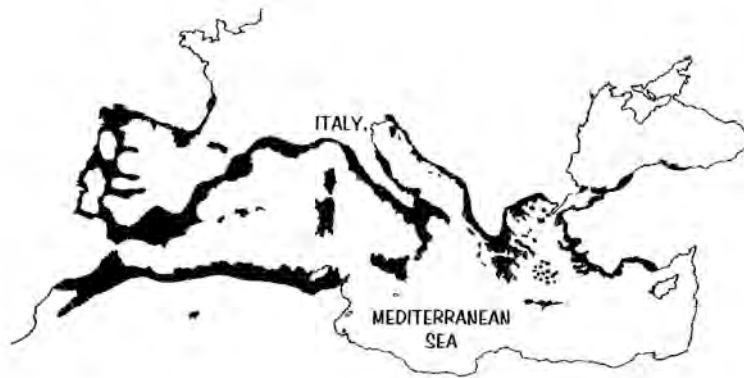
Figure 1. Map of approximate distribution of Arbutus unedo in the Mediterranean area