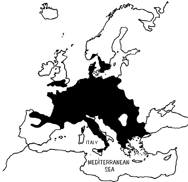
Figure 1. Map of approximate distribution of Fagus sylvatica in Europe. AFE 2007